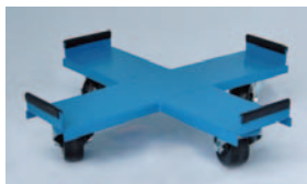
Roller base for larger dewars