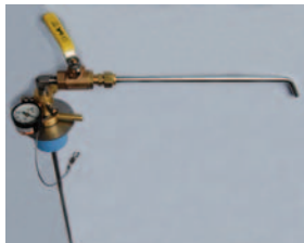
Liquid nitrogen withdrawal device