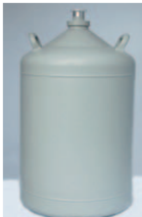
IC-20D LN2 NW Flange Dewar

For complete details on available accessories please see our Liquid Nitrogen Storage Dewar Accessories page.