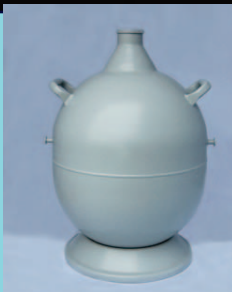
25 Liter Ball Dewar